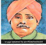
Lala Lajpat Rai

SERVANTS OF THE PEOPLE SOCIETY (DELHI) BALVANTRAY MEHTA VIDYA BHAWAN ANGURIDEVI SHERSINGH MEMORIAL ACADEMY ( Senior Secondary School for Integrated Education-Recognised & Affiliated to C.B.S.E.) Greater Kailash-II, New Delhi – 110 048 www.bmvbasma.edu.in Phone : 29221798, 41616607 e mail : scbasma11@hotmail.com School ID – 1925273 CBSE AFF NO – 2730285 EXAM CODE – 25220