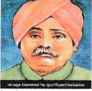
Lala Lajpat Rai

School ID – 1925273 CBSE AFF NO – 2730285 EXAM CODE – 25220