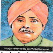
Lala Lajpat Rai

SERVANTS OF THE PEOPLE SOCIETY (DELHI) BALVANTRAY MEHTA VIDYA BHAWAN ANGURIDEVI SHERSINGH MEMORIAL ACADEMY ( Senior Secondary School for Integrated Education-Recognised & Affiliated to C.B.S.E.) Greater Kailash-II, New Delhi – 110 048 www.bmvbasma.edu.in Phone : 29221798, 41616607 e mail : scbasma11@hotmail.com School ID – 1925273 CBSE AFF NO – 2730285 EXAM CODE – 25220