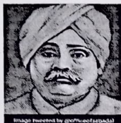
Lala Lajpat Rai