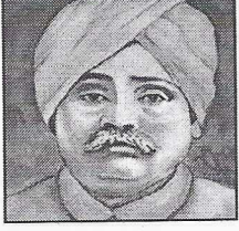
Lala Lajpat Rai

SERVANTS OF THE PEOPLE SOCIETY (DELHI) BALVANTRAY MEHTA VIDYA BHAWAN ANGURIDEVI SHERSINGH MEMORIAL ACADEMY (Senior Secondary School for Integrated Education-Recognised & Affiliated to C.B.S.E.) Greater Kailash-II, New Delhi – 110 048 www.bmvbasma.edu.in Phone : 43029496, 41616607, 43715301, 45543654, 47508754 e mail : scbasma11@hotmail.com School ID – 1925273 CBSE AFF NO – 2730285 EXAM CODE – 25220 DRAW OF LIST NURSERY ADMISSION 2024-2025 GENERAL CATEGORY