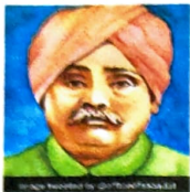
Lala Lajpat Rai

SERVANTS OF THE PEOPLE SOCIETY (DELHI) BALVANTRAY MEHTA VIDYA BHAWAN ANGURIDEVI SHERSINGH MEMORIAL ACADEMY ( Senior Secondary School for Inclusive Education-Recognised & Affiliated to C.B.S.E.) Greater Kailash-II, New Delhi – 110048 www.bmvbasma.edu.in Phone : 43029496, 41616607 e mail : scbasma11@hotmail.com School ID – 1925273 CBSE AFF NO – 2730285 EXAM CODE – 25220