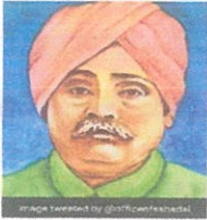
Lala Lajpat Rai