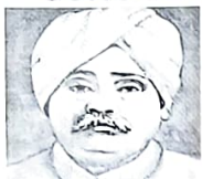
Lala Lajpat Rai

No.BMVBASMA/DOE/Fee Structure:2026-2027/2025-2026/