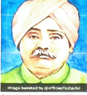
Lala Lajpat Rai

SERVANTS OF THE PEOPLE SOCIETY (DELHI) BALVANTRAY MEHTA VIDYA BHAWAN ANGURIDEVI SHERSINGH MEMORIAL ACADEMY ( Senior Secondary School for Inclusive Education-Recognised & Affiliated to C.B.S.E.) Greater Kailash-II, New Delhi – 110048 www.bmvbasma.edu.in Phone : 43029496, 41616607, e mail : scbasma11@hotmail.com School ID – 1925273 CBSE AFF NO – 2730285 EXAM CODE – 25220