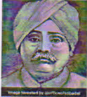
Lala Lajpat Rai