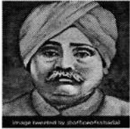
Lala Lajpat Rai